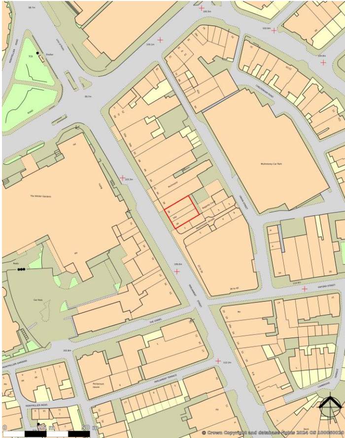
Error! Filename not specified.